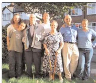
All present and correct