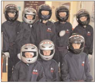
Kartonauts prepare for action