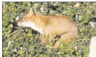
The quick brown fox at Ditton Corner

Save the Date... 2007 Bumps & Carnage Party Saturday 16 June 2007