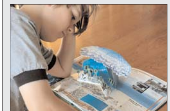
Pop-Up Book: A Tsunami rears up on page 16

They're available in all good bookstores. Just the stocking filler you were looking for.