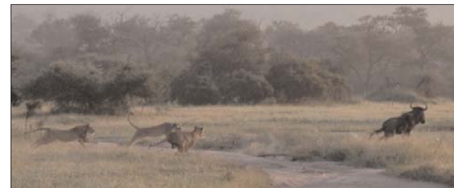
The lion pride hunts a wildebeest at dawn - a gnu experience for us all