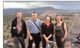
Atop the pyramids of Teotihuacan, Mexico

The group's bonding experiences continued post-conference with a team assault on the pre-Aztec pyramids of the Sun and Moon, followed by a guerrilla action to regain access to their hotel through crowds that blocked the main Zocalo Square in protest at the disputed result of Mexico's presidential election.