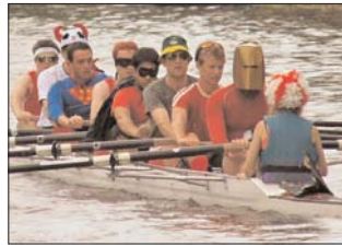
Super-heroes first VIII

This year's party to watch the Bumps rowing races at Ditton Corner was a highpoint of rowing spectacle and, of course, millinery excellence. The fine display of hats (thanks everyone) is featured on our website. Celebrity guests and damsel flies enlivened the day, and it was great to see so many babies and young guys on the river bank - super-heroes of tomorrow.