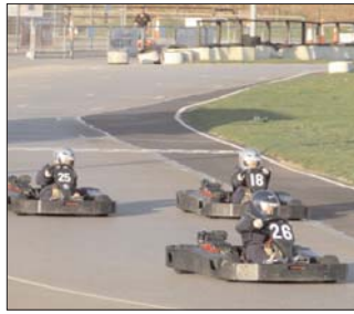
Boys with their toys