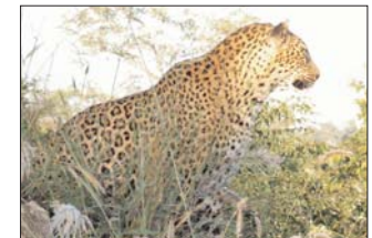
Vomba female leopard in Londolozi game reserve

Surfing and snorkeling on the South African coast also got us close to the morays and sharks offshore. Boy, this ecosystem has attitude! But the beasts on land were the real stars. With cameras locked and loaded, we