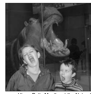
Hippo Potty Mouths at the Natural History Museum