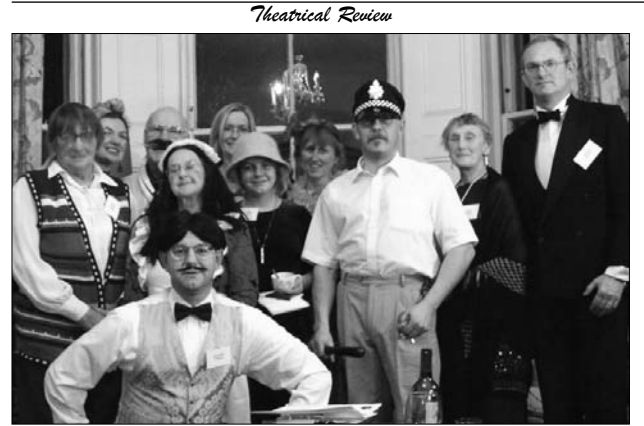
The cast of 'The Final Curtain' a Christmas Day 1920s murder mystery