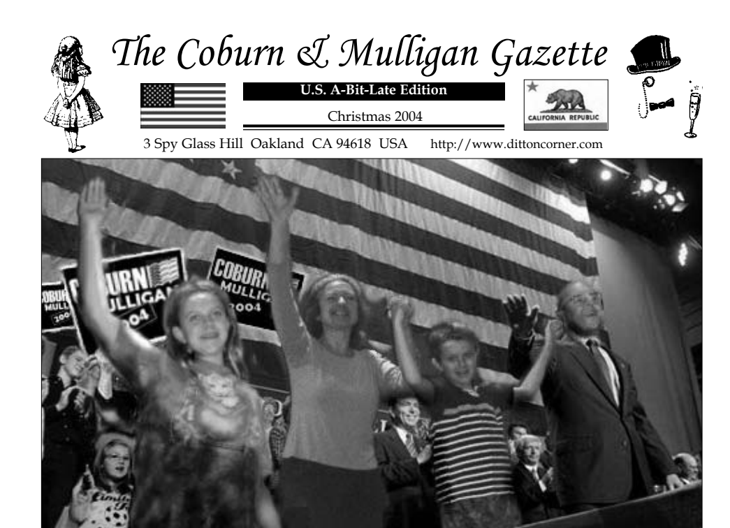
Returning back to the white house on the Cam in 2005

Keep up with our family news on our web site www.dittoncorner.com